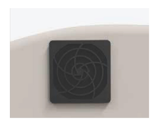
COOLING FAN (SC202MHD) FOR INTENSIVE USE

With 230 Vac CT102B control unit with integrated display