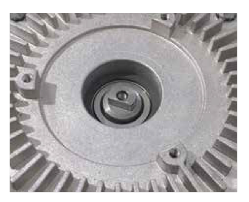
STURDY AND PERFORMING MOTOR