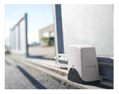
ELECTRONIC AND MECHANICAL PARTS WELL PROTECTED FROM WEATHER CONDITIONS