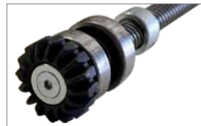
Double bearing on the main screw to grant robustness and movement fluidity