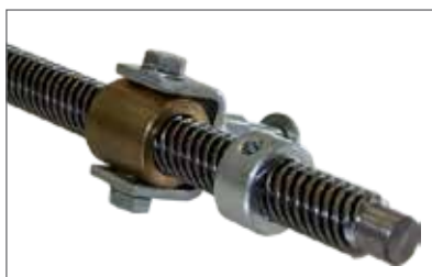
Robust bronze lock nut on endless screw

Compatible with 230 Vac control unit CT202, (pag. 143 for technical details)