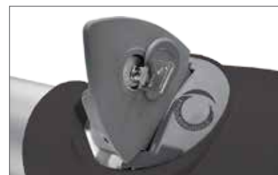
Easy mechanical release